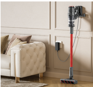
Easy to charge and store wall dock