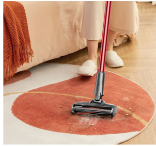
Tangle-resistant carpet roller