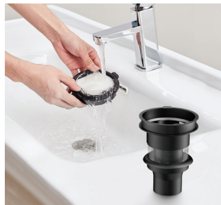
Easily clean with water