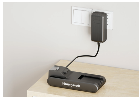
High-Capacity Battery Pack up to 70 minutes*