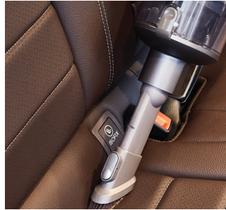
Deluxe 2-in-1 crevice tool