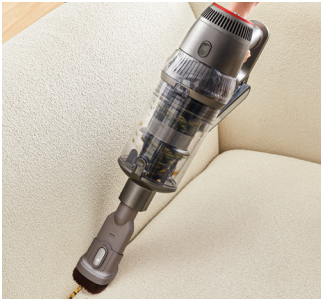
Deluxe 2-in-1 sofa brush