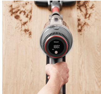
Easy one-touch control with LED display