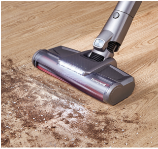
Tangle-resistant soft roller with bright white LED lights for hard floors