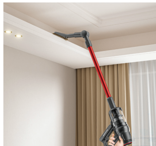
Soft brush with bendable connector is great for hard-to-reach areas, under chairs, and more