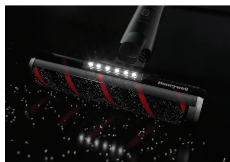
Natural Brite White LED Lights on Soft Roller for Better Clarity