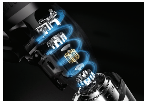
Innovative 630W Synchronized Digital Motor up to 220AW Extreme Suction