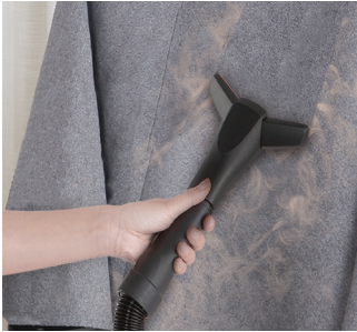
Deluxe pet hair removal brush